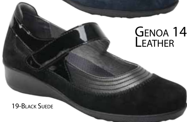
GENOA 14316 LEATHER

N (AA).....6-12 M (B).....5-12, 13 W (D).....5-12, 13 WW (EE)...5-12, 13