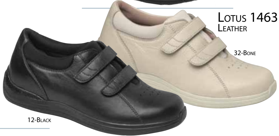
LOTUS 14631 LEATHER