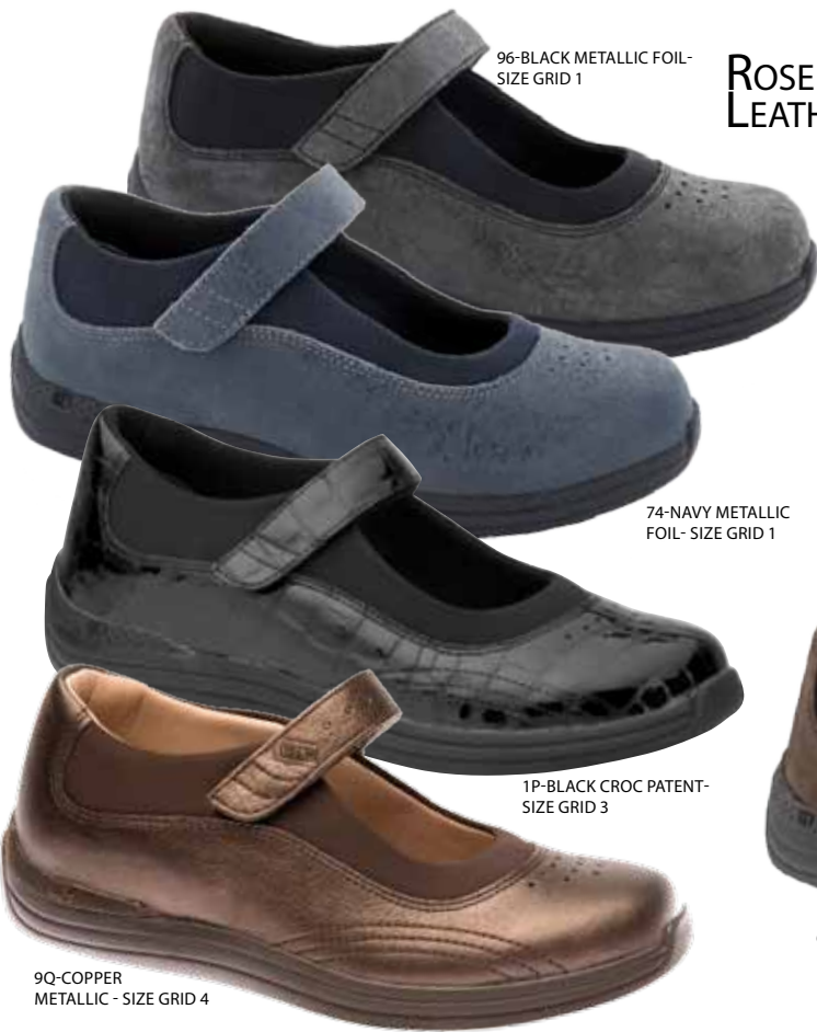
96-BLACK METALLIC FOIL- SIZE GRID 1