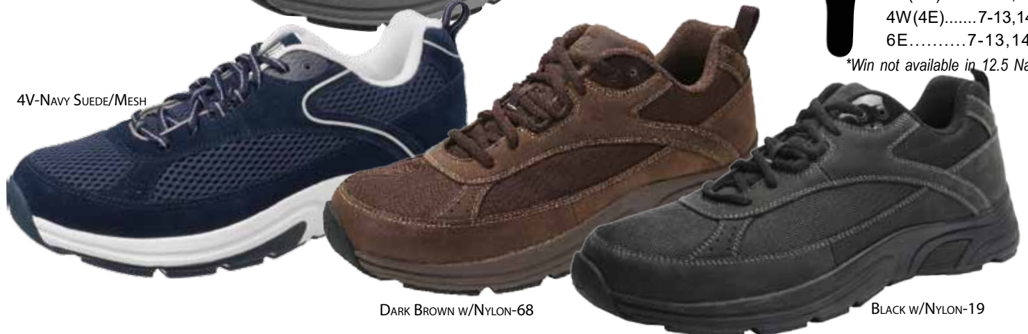
DARK BROWN W/NYLON-68