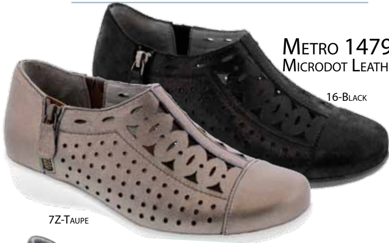
METRO 14794 MICRODOT LEATHER