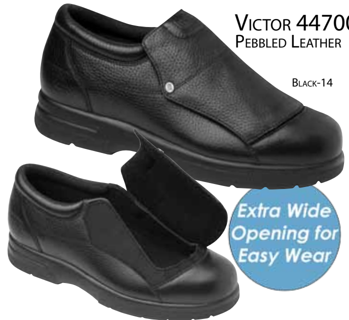
VICTOR 44700 PEBBLED LEATHER