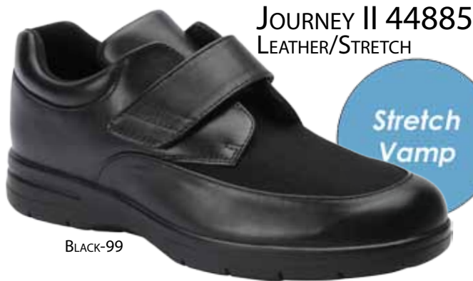
JOURNEY II 44885 LEATHER/STRETCH