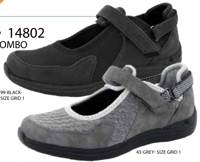
99-BLACK- SIZE GRID 1