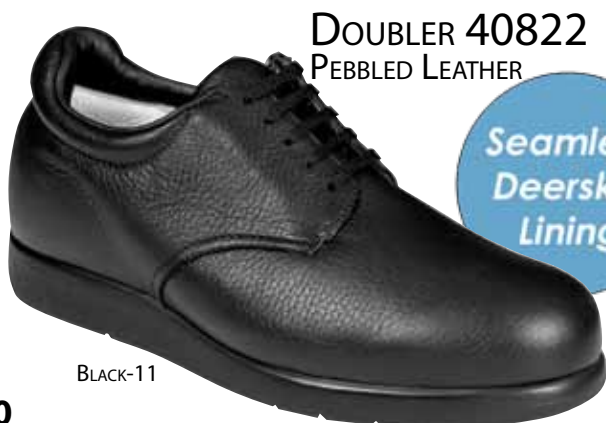
DOUBLER 40822 PEBBLED LEATHER