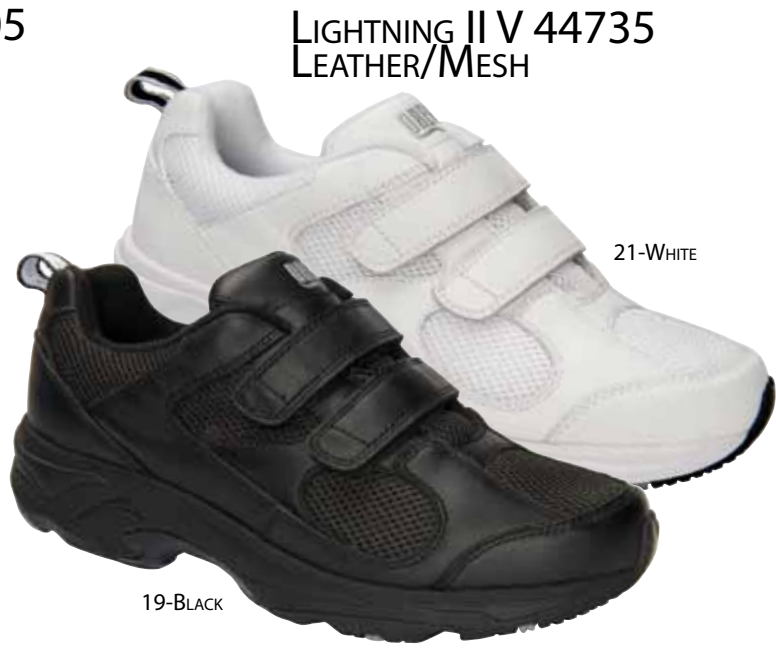
LIGHTNING II V 44735 LEATHER/MESH