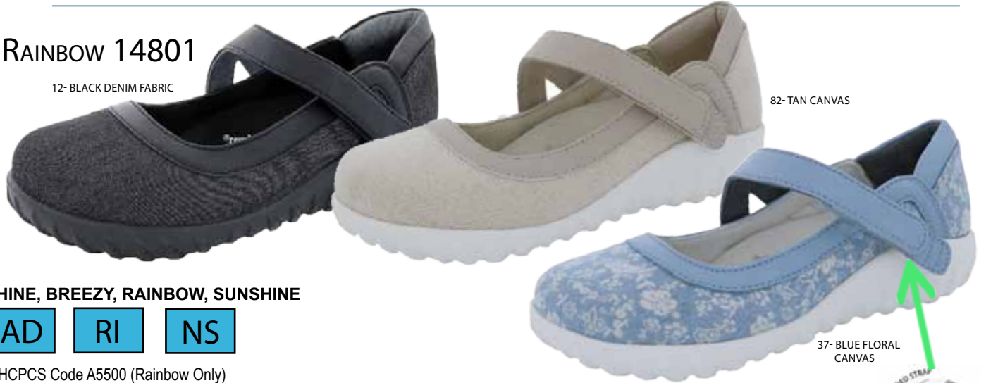
37- BLUE FLORAL CANVAS