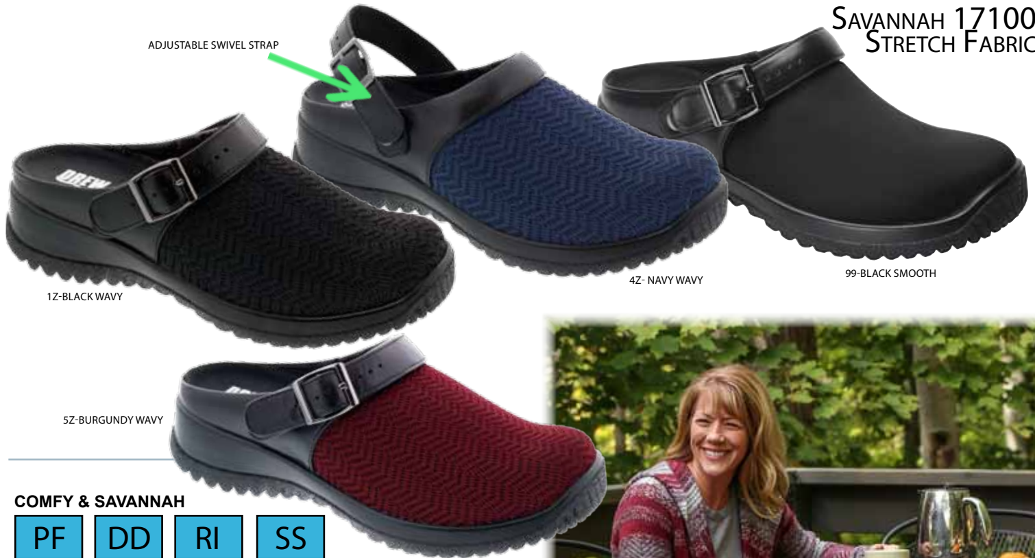
ADJUSTABLE SWIVEL STRAP