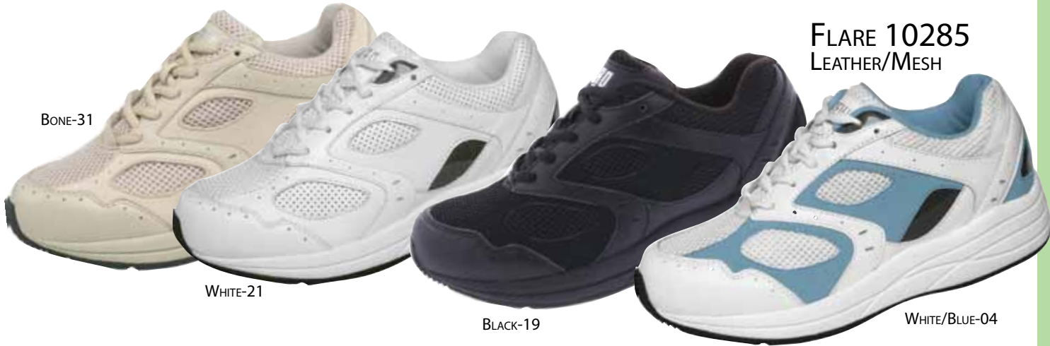
FLARE 10285 LEATHER/MESH