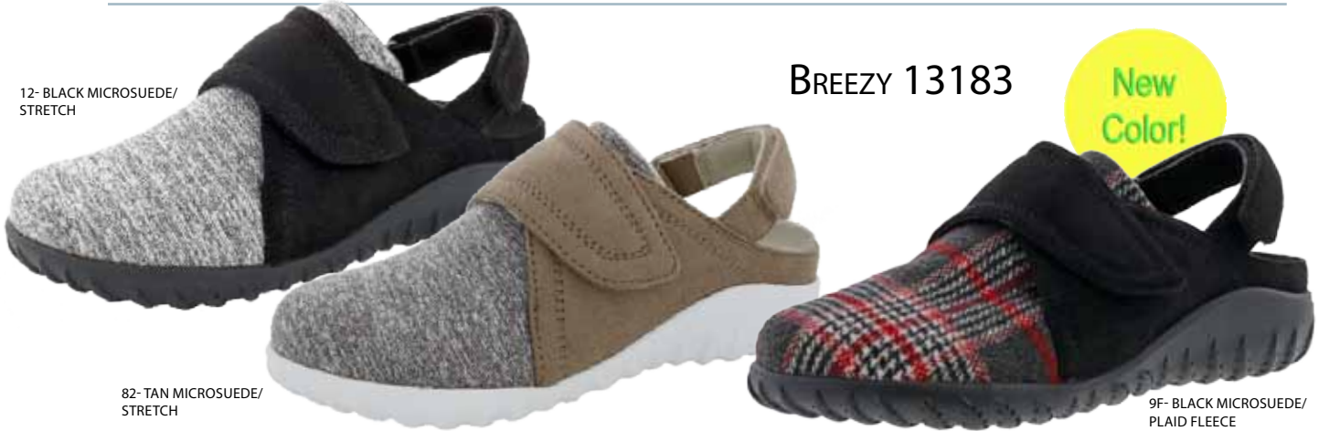
82- TAN MICROSUDE/ STRETCH