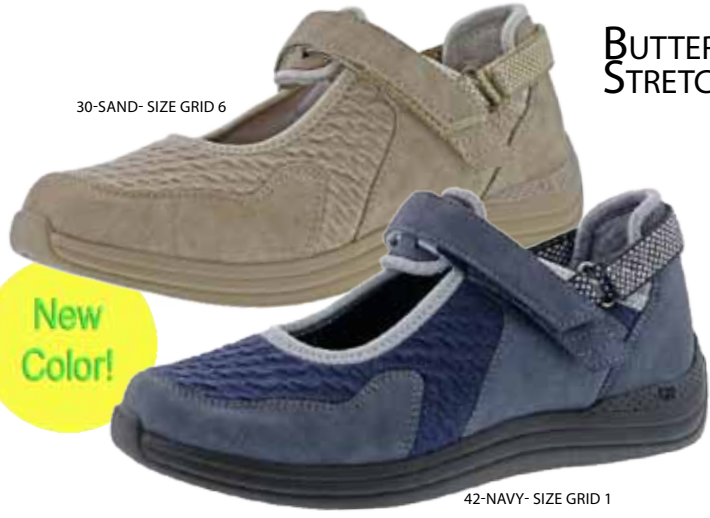
30-SAND- SIZE GRID 6