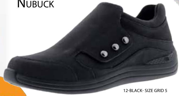
12-BLACK- SIZE GRID 5