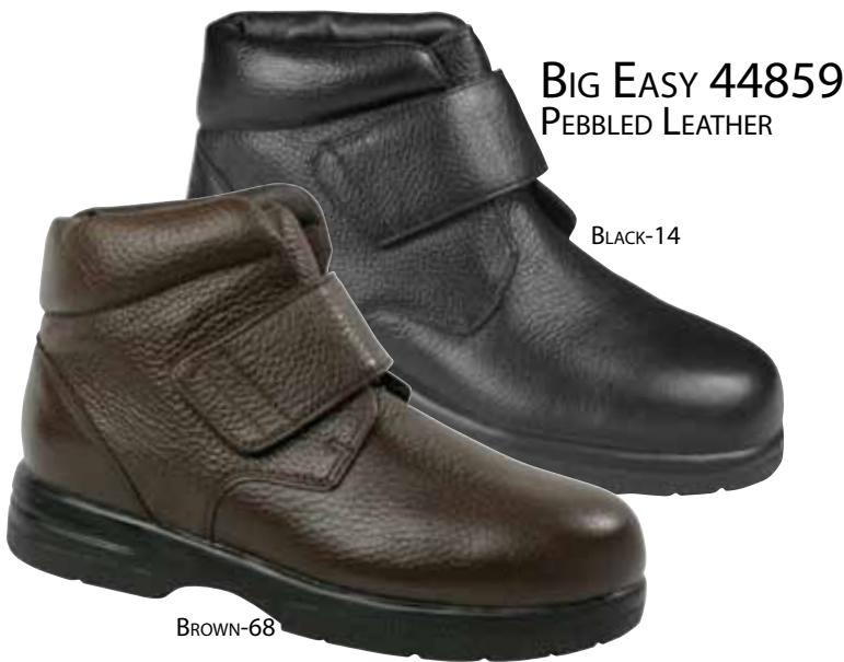
BIG EASY 44859 PEBBLED LEATHER