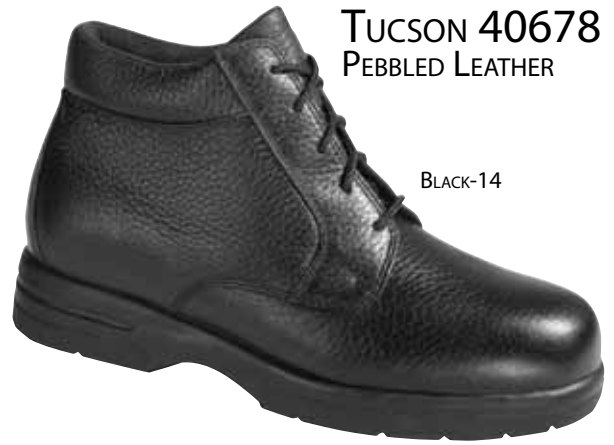
TUCSON 40678 PEBBLED LEATHER