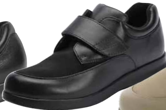
QUEST 14251 LEATHER/STRETCH