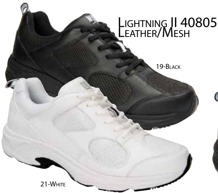
LIGHTNING II 40805 LEATHER/MESH