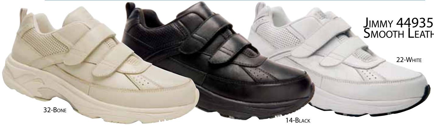
JIMMY 44935 SMOOTH LEATHER