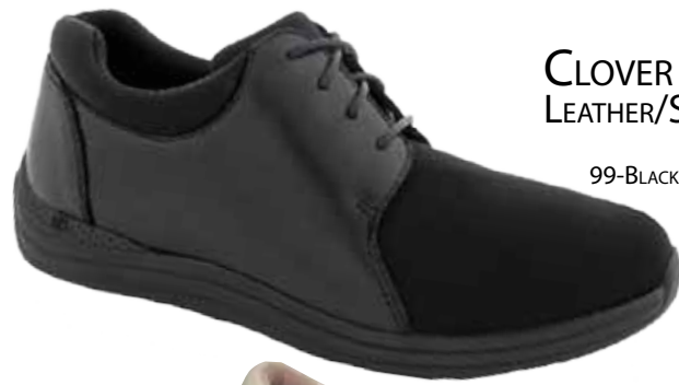
CLOVER 10300 LEATHER/STRETCH