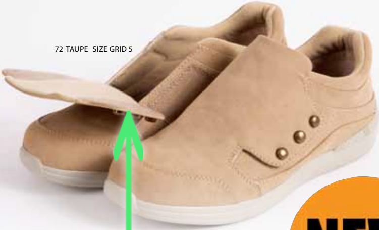
72-TAUPE- SIZE GRID 5