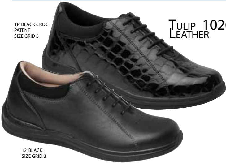
12-BLACK- SIZE GRID 3