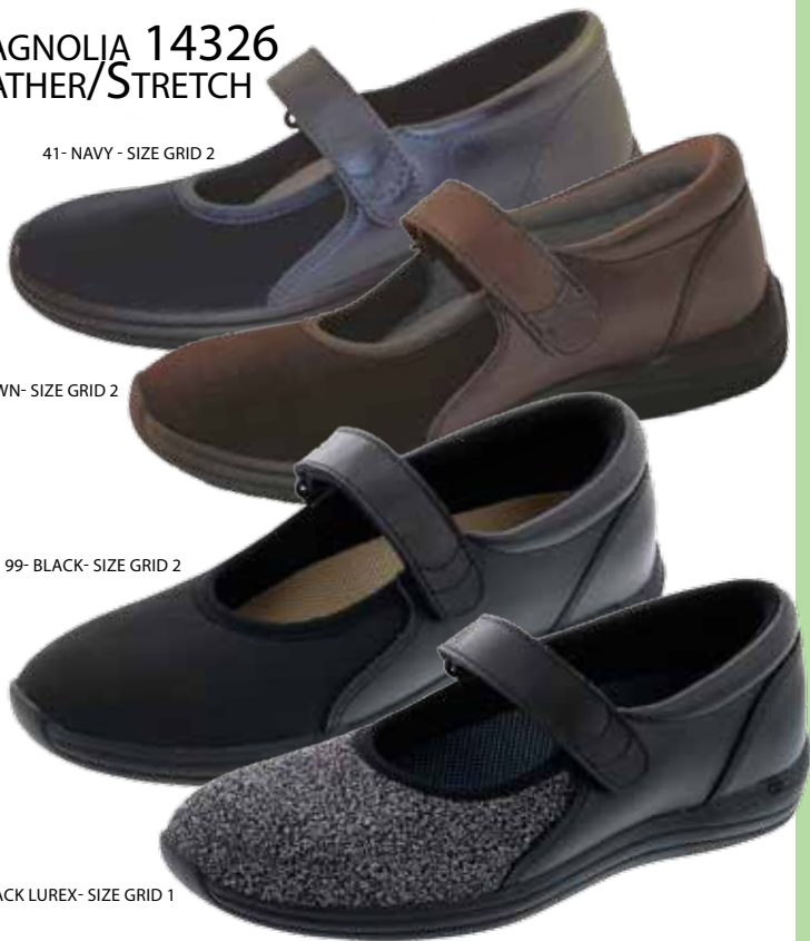
41- NAVY - SIZE GRID 2