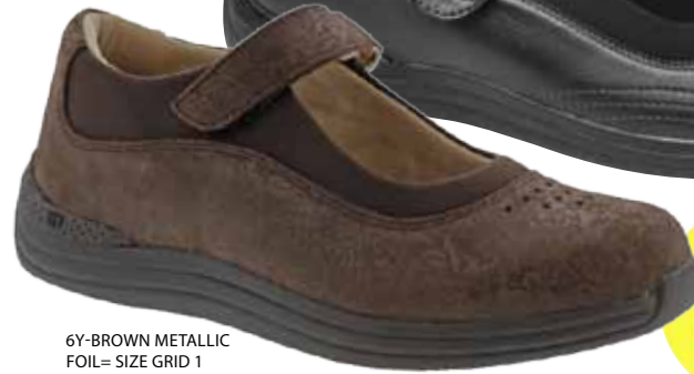
6Y-BROWN METALLIC FOIL= SIZE GRID 1