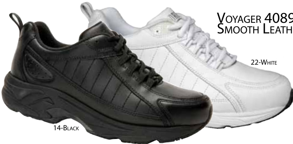
VOYAGER 40890 SMOOTH LEATHER