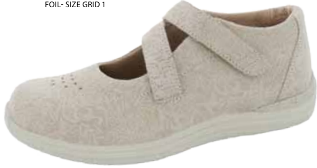
3Y-BONE METALLIC FOIL- SIZE GRID 1