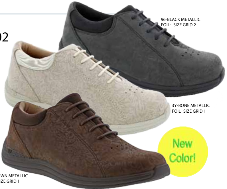
3Y-BONE METALLIC FOIL- SIZE GRID 1