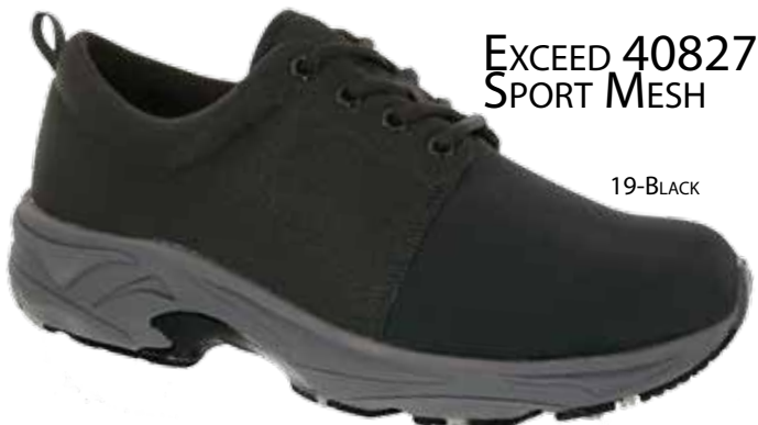
EXCEED 40827 SPORT MESH